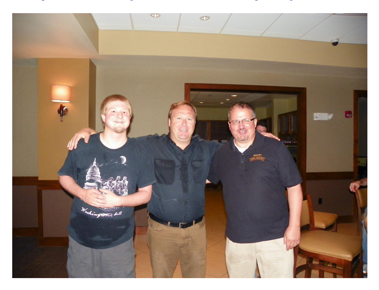
PAGE 2 OF 8 - LETTER TO ATTORNEY(S) OF STEWART RHODES - OCT. 4, 2022

See link: https://web.archive.org/web/20120815003417/http://uswgo.com/